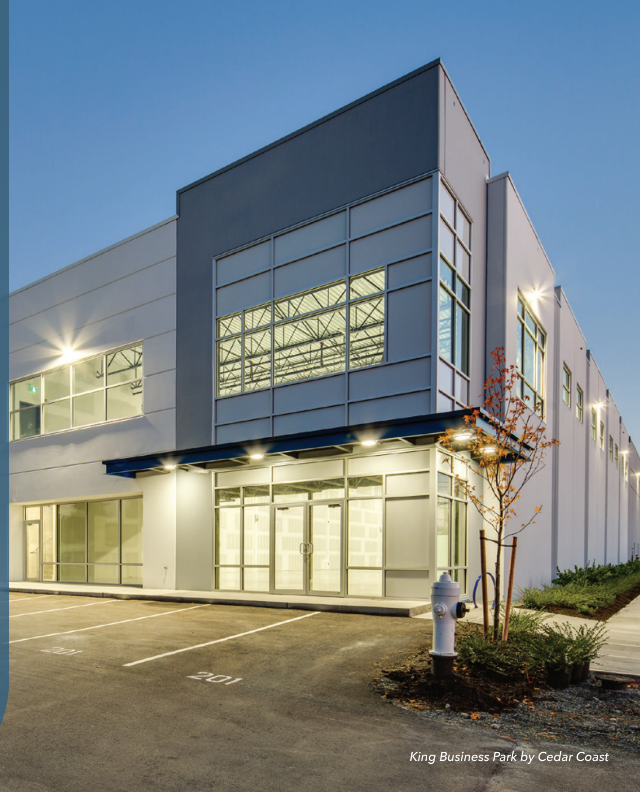
King Business Park by Cedar Coast

Build up a retirement plan by turning your property into an investment if you move.