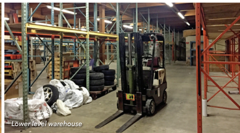
Lower level warehouse