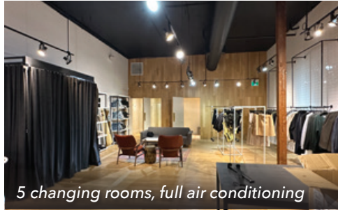
5 changing rooms, full air conditioning