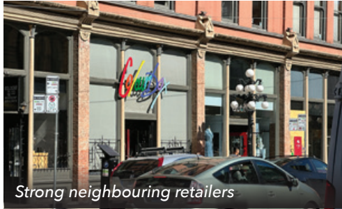
Strong neighbouring retailers