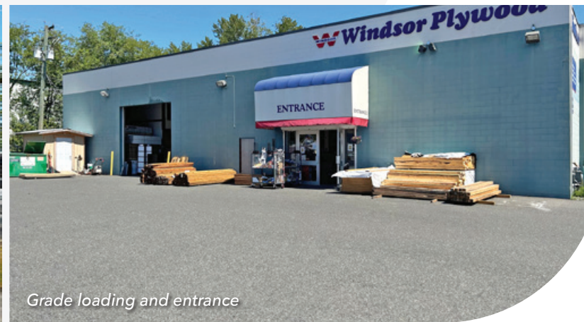
Grade loading and entrance