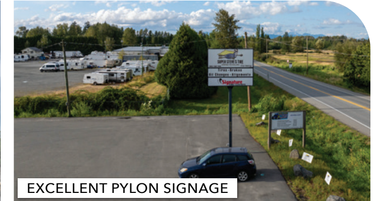
EXCELLENT PYLON SIGNAGE