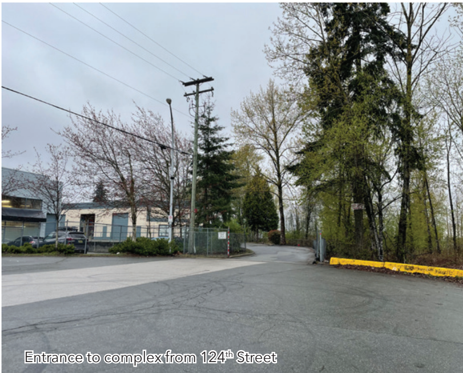
Entrance to complex from 124 th Street