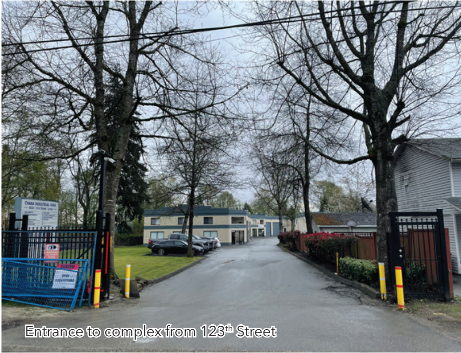
Entrance to complex from 123 th Street

FOR SALE OR LEASE | INDUSTRIAL #24-25 - 8528 123RD STREET SURREY, BC